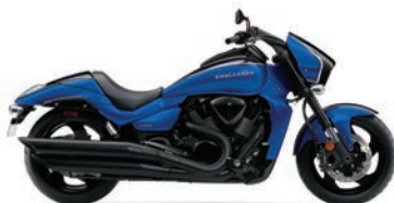
Pearl Vigor Blue / Glass Sparkle Black