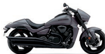
Metallic Matte Fibroin Gray